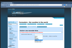
Screenshot of translated French Tracker