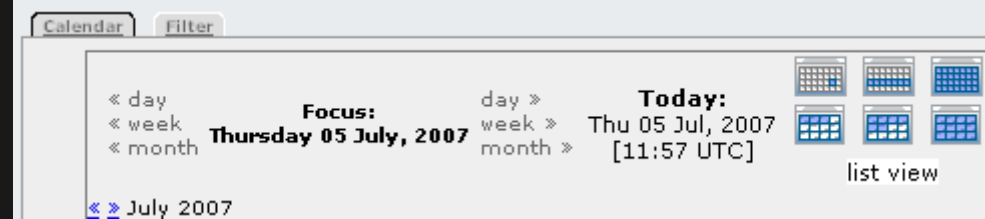
Calendar Navigation Bar