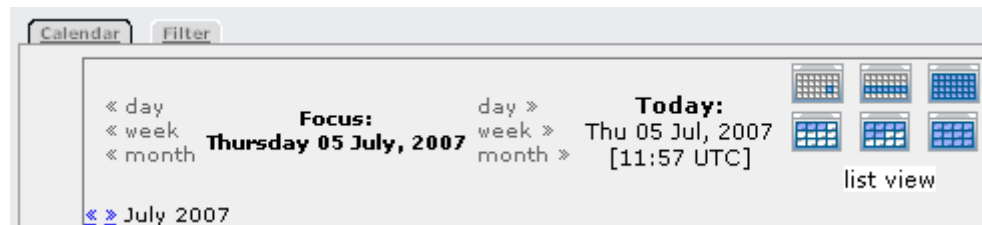
Calendar Navigation Bar