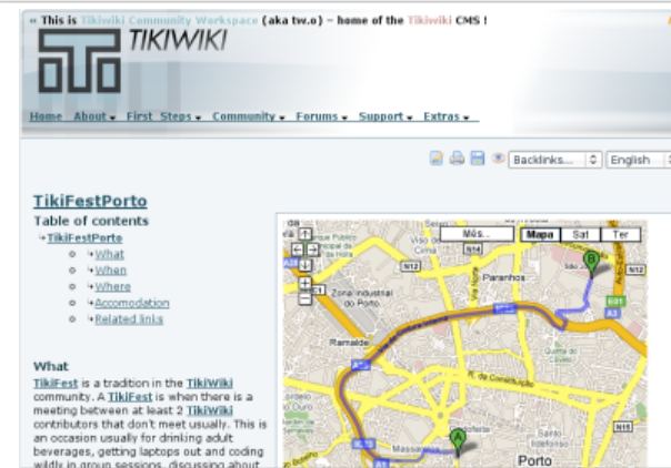
Embedded external dynamic content inside a Wiki page

Dynamic Content Admin explains the step to produce it.