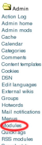
Figure 2. Selecting the module

3. Add the Shoutbox module and assign the groups which can use it. In our example, we've limited use to the registered group. We've positioned it as the second item in the right column.