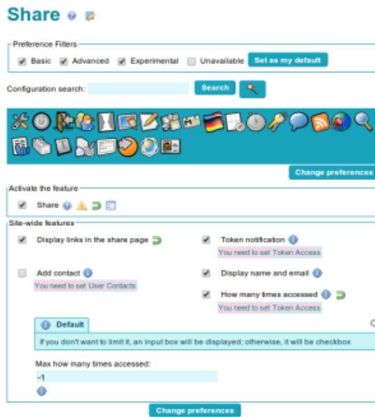
Tiki 9 Preferences Image