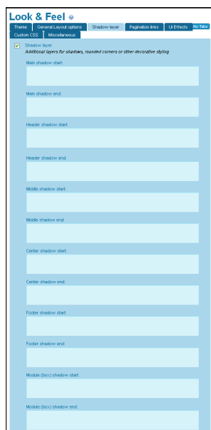
Shadow Layer tab