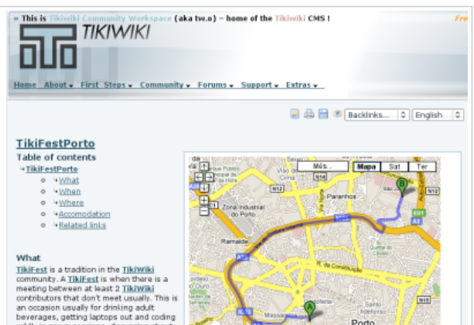
Embedded external dynamic content inside a Wiki page