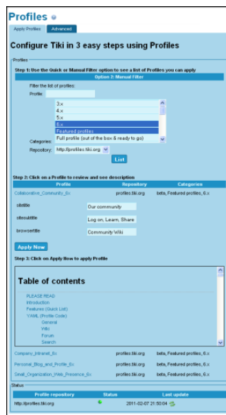
Apply Profiles tab