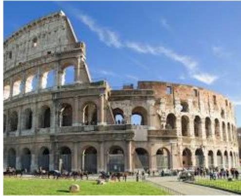
Colosseum, Rome, Italy

Colosseum, giant amphitheatre built in Rome under the Flavian emperors.