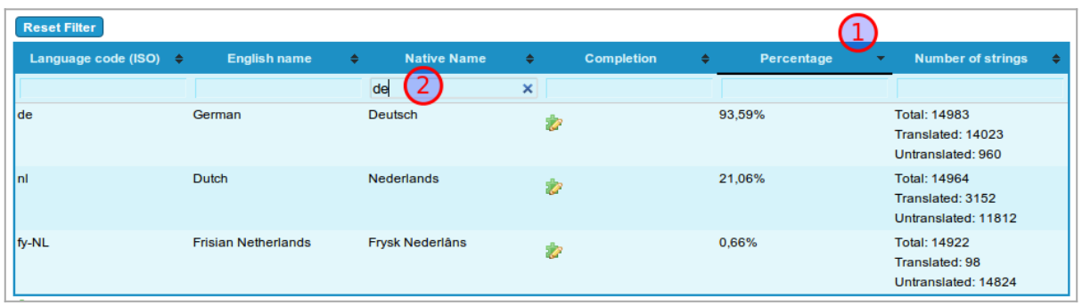
Click to expand

In Plugin FancyTable, you can as usual sort by one or more columns, but since Tiki12 you can also filter you results by searching for some string in one or more columns. In the example below, sorted by one column ("Percentage"), and filtered by content in another column ("Native name" containing "de"):