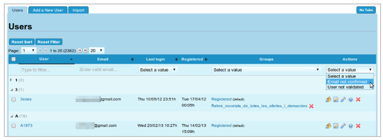
Click to expand

For instance, for user administration, you nowadays have many more filtering options to select users from the users list. You can filter by a search string in the username, by exact email, by the fact that users didn't validate their account, etc. All of them using the jQuery Sortable Tables feature.