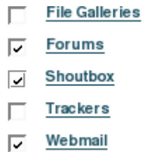
Figure 1. Enabling Shoutbox

1. Enable the Shoutbox feature on the Administration:Features page by clicking on the checkbox and clicking the "Change Preferences" button at the bottom of the page to save your change.