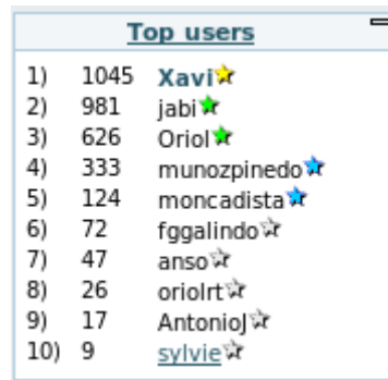
Module users_rank from scores

things they do in the site, like writing an article, reading an article, starting a new topic in forum, voting a poll, etc. They also earn points by being popular, like having his/her blogs and articles read and commented. Then the users will be able to see their position in a ranking.