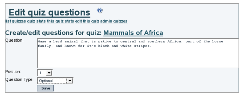
Click to expand

To create questions one at a time from the web interface, go to the Quiz Admin page and click on "questions" for the quiz you wish to build. You'll open the Edit Quiz Question page: