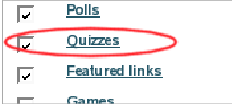
Click to expand

Select Admin--->Features, and then click the checkbox next to the Quizzes option