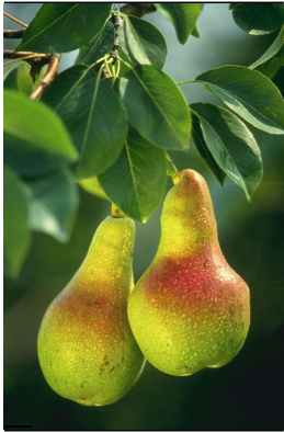
+ Pretty pears