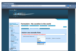
Screenshot of translated French Tracker