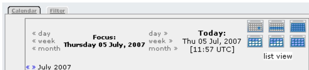
Calendar Navigation Bar