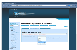
Screenshot of translated French Tracker