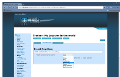
Screenshot of English Tracker