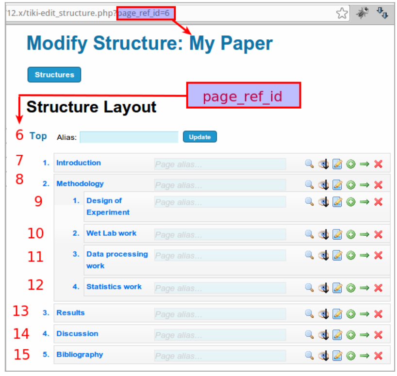
Click to expand

The homepage of the structure has page_ref_id=6. If we added that number to the module menu Structure Id param, the full structure tree would be used for the menu. If we use another page_ref_id, from a subtree of the structure (like page_ref_id=8, for the subsections of "Methodology"), then that subtree would be used to create the menu.