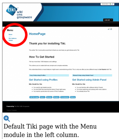
Default Tiki page with the Menu module in the left column.