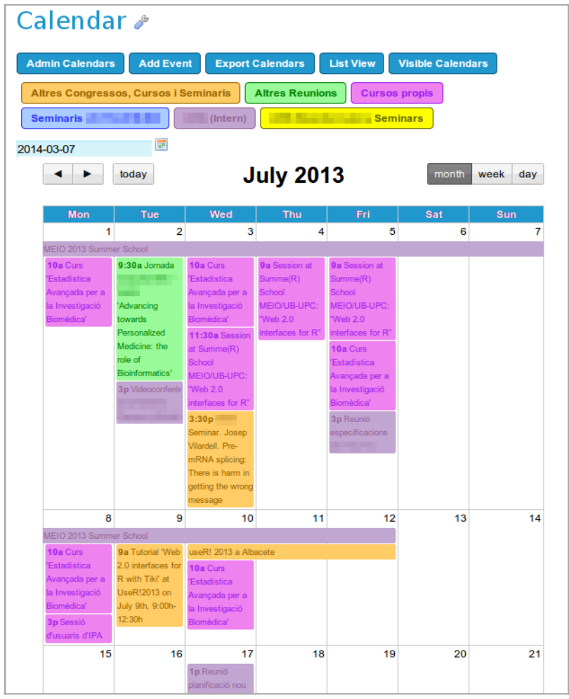
Click to expand

The following sections explain how to perform these actions.