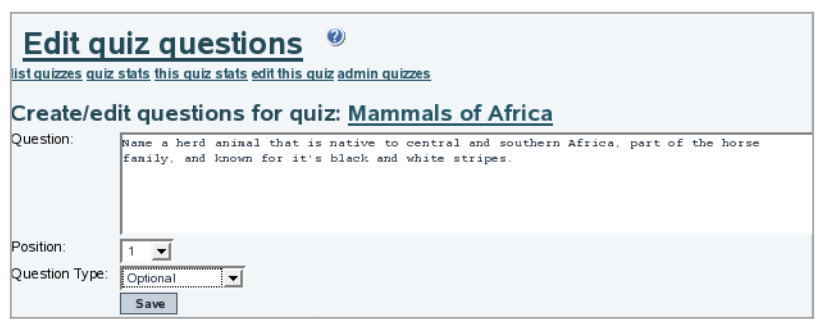
Click to expand

To create questions one at a time from the web interface, go to the Quiz Admin page and click on "questions" for the quiz you wish to build. You'll open the Edit Quiz Question page: